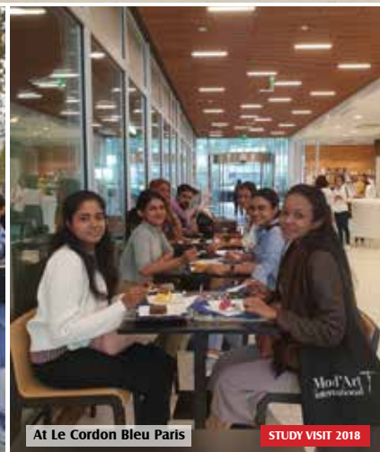
At Le Cordon Bleu Paris