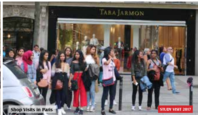
Shop Visits in Paris