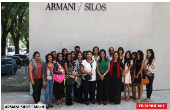
ARMANI SILOS - Milan