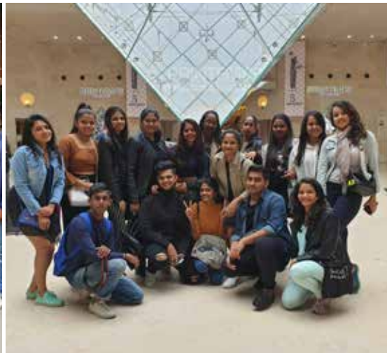
Visit to Louvre Museum