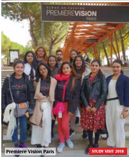
Premiere Vision Paris