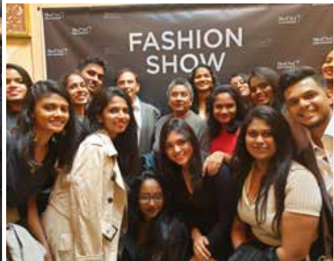
PARIS, LONDON, MILAN, NEW YORK