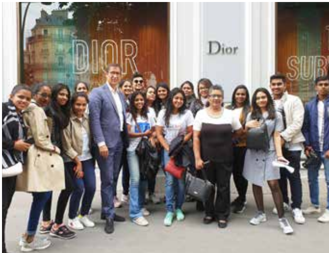
Visual Merchandising Visits at Dior Flagship store