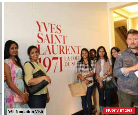
YSL Fondation Visit